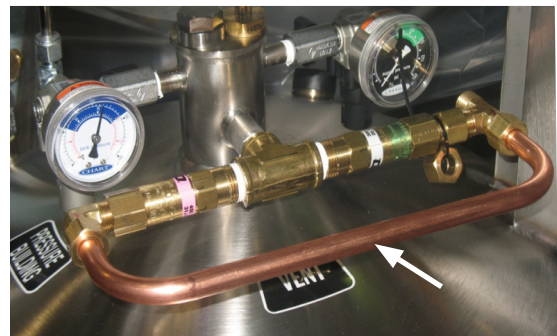
Picture 2 Discontinued “C” Shaped Pressure relief vent tube assembly (Shown on vessel not equipped with Sure-Fill™ feature.)

If you have questions or concerns about the relief pressure vent tube configuration change, please contact your Chart Technical Service Representative at 800-253-1769 or 952-758-4400. Thank you for depending on Chart for high product quality, service and continuous product improvement.